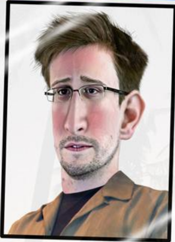
Edward Snowden Sys Admin